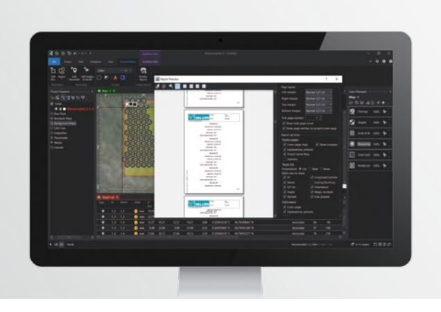
Simple creation of customizable project reports for immediate output of documentation