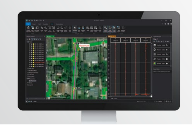
Placement of marker with simultaneous display of measured data, track views, etc.

EVA4ALL<sup>®</sup> sets new standards in the display and handling of large data volumes