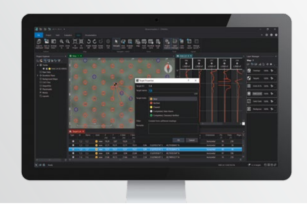
Speedy object calculation, including from georeferenced borehole data