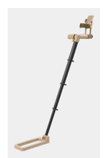
Metal Detektor VMC4, sand