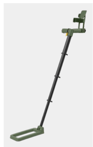
Metal Detector VMC4, olive