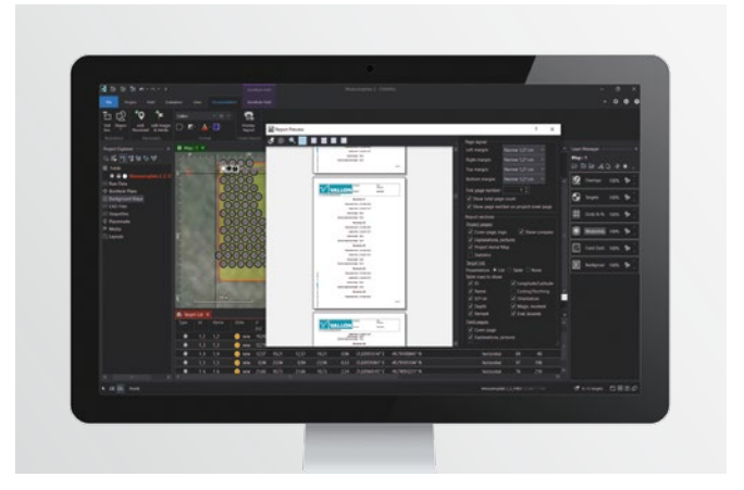
Simple creation of customizable project reports for immediate output of documentation