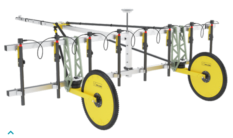
Trailer VXVT wide – Prepared for up to 8 probes with a distance of 50 cm (shown with optional components)