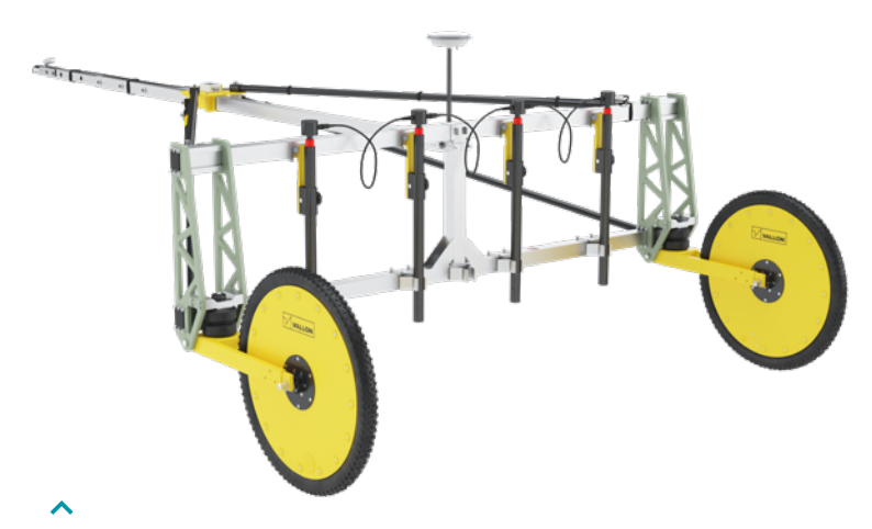
Trailer VXVT slim – Prepared for up to 4 probes with a distance of 50 cm (shown with optional components)