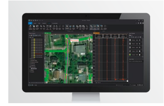
Placement of marker with simultaneous display of measured data, track views, etc.

EVA4ALL® – Software Solution for Microsoft Windowsfor Display, Georeferencing, Evaluation and Documentation of Surface and Borehole Data