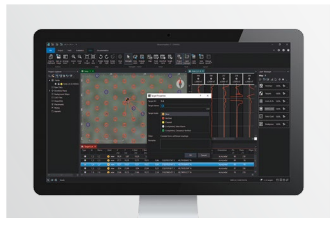
Speedy object calculation, including from georeferenced borehole data